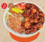
Spicy Korean Chicken 스파이시 코리아 치킨 컵밥 (매운 양념 치킨)