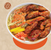
Sweet Chili Oven Chicken 스윗칠리 오븐 치킨 컵밥