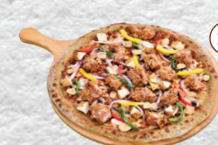
Garlic Butter Chicken

Cheese, Cheddar cheese, Onion, Mushrooms, Fried chicken, Garlic Butter Sauce, Potato chunks, Bell peppers