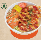
Sweet Chili Katsu 스윗 칠리 카츠 컵밥