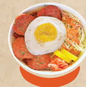
Spam & Fried Egg 스팸&계란후라이 컵밥