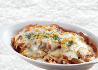
BEST Meat Cheese Spaghetti

Spaghetti, Cheese, Garlic oil, Sliced onion, Sliced mushrooms, Ground beef, White wine, Diced bell peppers, Stock, Tomato $9.90