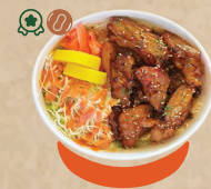
Korean Galbi Oven Chicken 코리아 갈비 오븐 치킨 컵밥