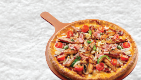
Garlic Chicken BBQ

BBQ sauce, Cheese, Onion, Bacon, Mushrooms, Chicken breast, Bell peppers, Cherry tomatoes, Sliced garlic, Cheddar cheese