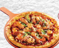
BEST Crazy Chicken Shrimp

Spicy sauce, Cheese, Cheddar cheese, Onion, Mushrooms, Chicken breast, Shrimp, Bell peppers