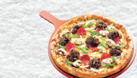
BEST Korean Bulgogi

Pizza sauce, Cheese, Onion, Mushrooms, Bulgogi, Bell peppers