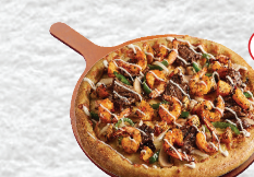
BEST Signature Shrimbul

Sweet ranch sauce, Cheese, Onion, Chopped pickles, Red peppers, Mushrooms, Bulgogi, Shrimp, Potato chunk, Paprika seasoning, Bell peppers, Sour cream