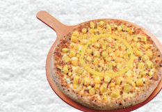
BEST Holy Honey Sweet Potato

Pizza sauce, Cheese, Cheddar Cheese, Corn, Onion, Sweet potato mousse, Diced sweet potato, Mayonnaise