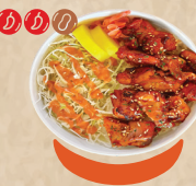
Buldak Oven Chicken 불닭 오븐 치킨 컵밥