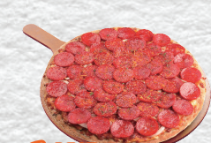
BEST Monster Pepperoni

Pizza sauce, Double extra cheese, Parmesan cheese, Pepperoni, Red pepper