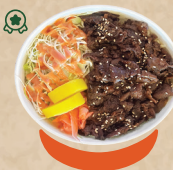
Bulgogi 불고기 컵밥