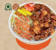
Korean Chicken 코리아 치킨 컵밥 (양념 치킨)