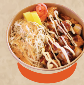
Terri Mayo Katsu 테리 마요 카츠 컵밥