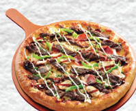
AAA Steaky Smoked

Pizza sauce, Cheese, Onion, Mushrooms, Rib Steak, Bell peppers, Steak sauce, Mayonnaise