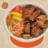
Soy Garlic Oven Chicken 소이 갈릭 오븐 치킨 컵밥