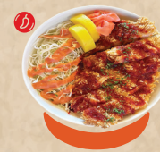
Spicy Katsu 스파이시 카츠 컵밥