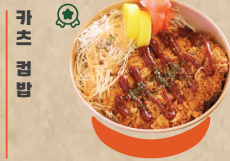
Original Katsu 오리지널 카츠 컵밥