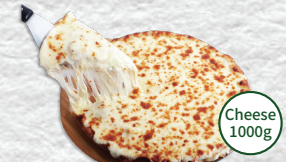
The "KABOOM!" Cheese Bomb