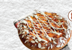
BEST Golden Chicago

String cheese, Cheese, Cream cheese mousse, Sour cream, Roasted onion, Mushrooms, Diced sweet potato, Cheddar cheese, Ham, Honey, Sliced almond, Parsley, Sugar powder